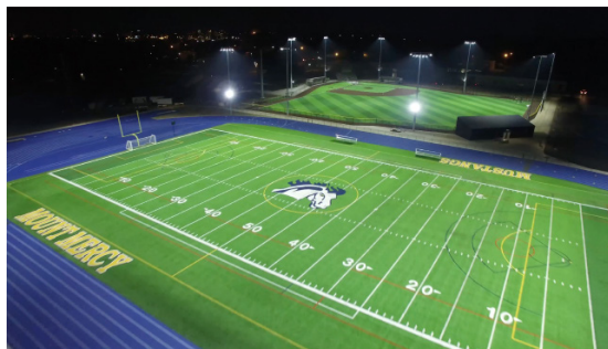
Robert W. Plaster Athletic Complex 651 19th Street NE Cedar Rapids, IA 52402

Make checks payable to: Mount Mercy Soccer Total $ _____ Hennessey Recreation Center 1330 Elmhurst Drive NE Cedar Rapids, IA 52402